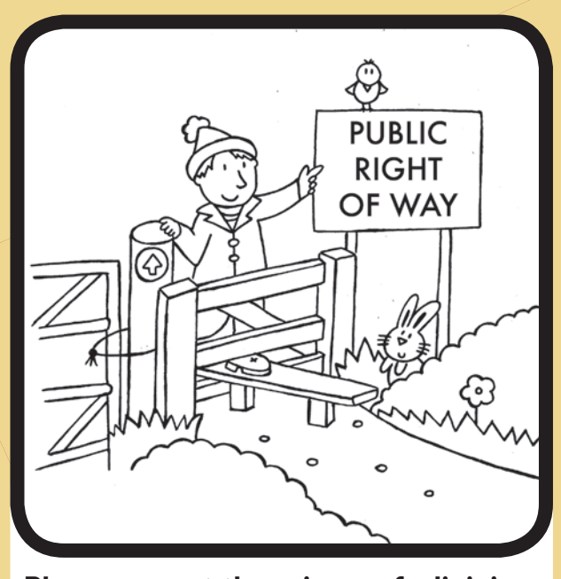
Please respect the privacy of adjoining properties and landowners

Please keep dogs on short leads within the tunnels.