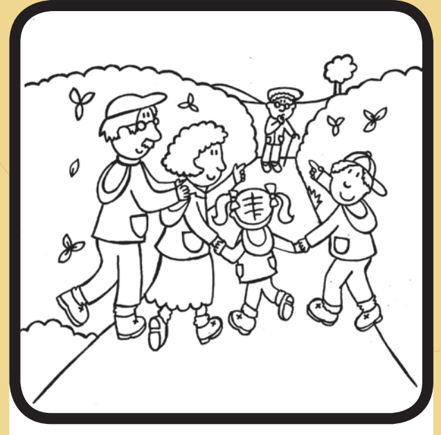
If the trail is busy, please avoid being in large groups across the trail

Use your bell or call out 'bike' to warn people of your approach and pass people slowly when it is safe to do so. Be aware that horses can be spooked by bikes.