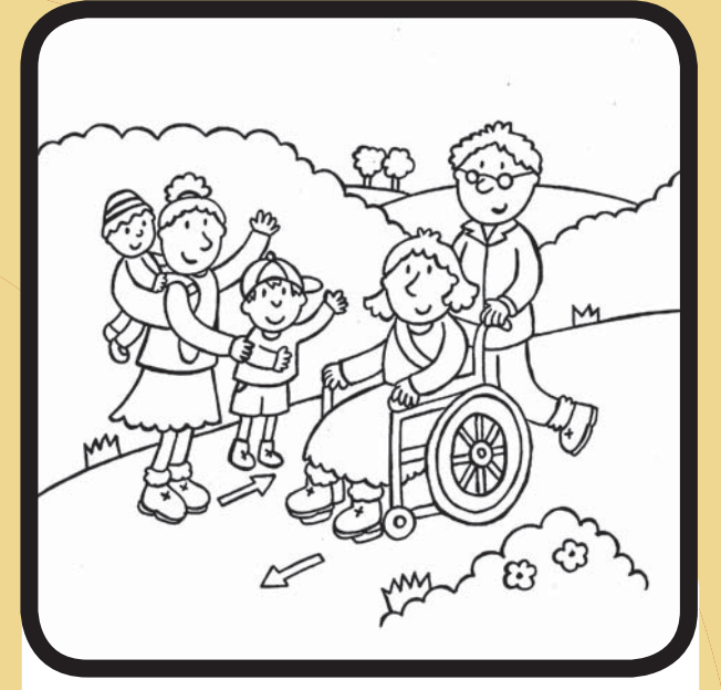
Please use the trail safely and be considerate to other users

The trail is not suitable for high speeds. Parents of young children on bikes need extra vigilance. Be aware other trail users may have disabilities.