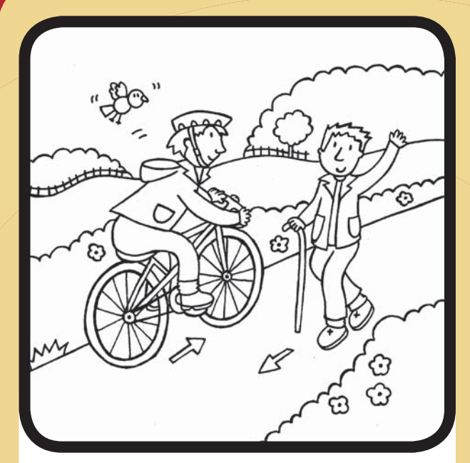
All users please keep to the left unless passing others