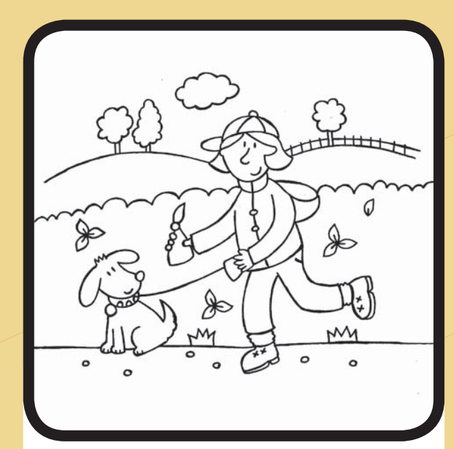
Do not drop litter and please clean up after your dog