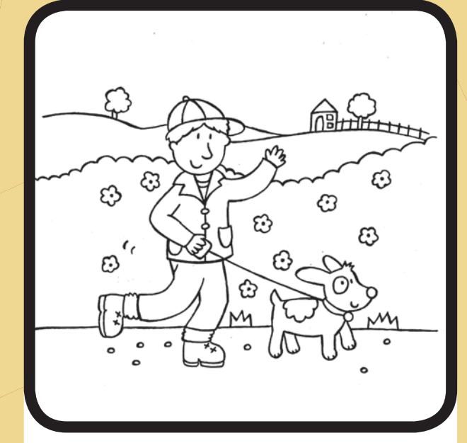
Dogs must be kept under close control at all times

Please keep dogs on short leads within the tunnels.